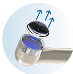
Special lens design